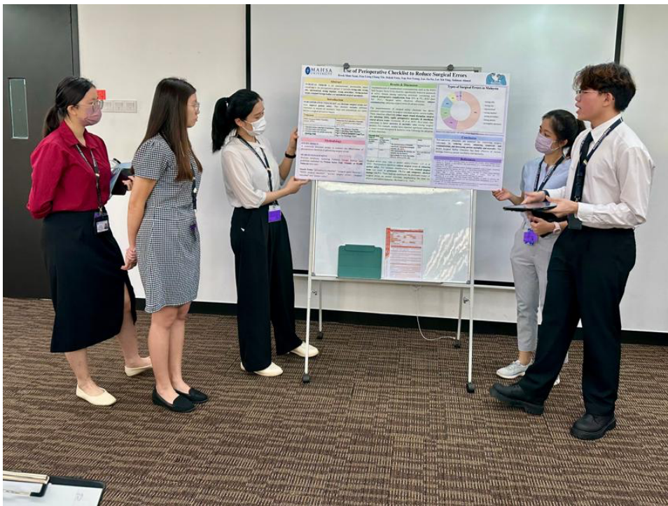
Poster presentation by students

The Patient Safety Project Poster Presentation began at 09:00 hours. Each team was given a designated time slot to present their poster and share their research findings. The presentations covered various aspects of patient safety, ranging from medication errors to infection control, and from communication within healthcare teams to patient-centered care. The event proceeded smoothly, with each team delivering insightful presentations. After each presentation, a brief question-and-answer session allowed the judges and the audience to engage with the participants and gain a deeper understanding of their projects.