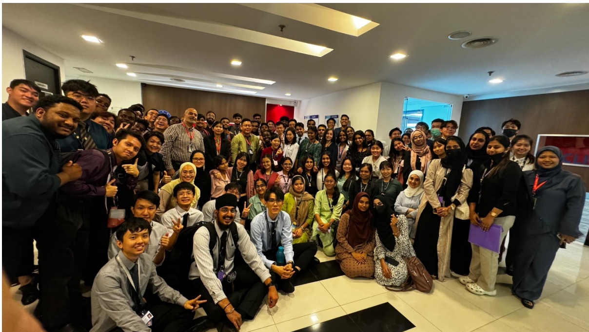
Year 4 MBBS students participating in Patient Safety Project Poster Presentation

The primary objective of the Patient Safety Project Poster Presentation was to raise awareness among young medical students about various aspects of patient safety. It aimed to foster an understanding of the critical role that safety measures play in healthcare and to encourage these future healthcare professionals to prioritize patient well-being throughout their careers.