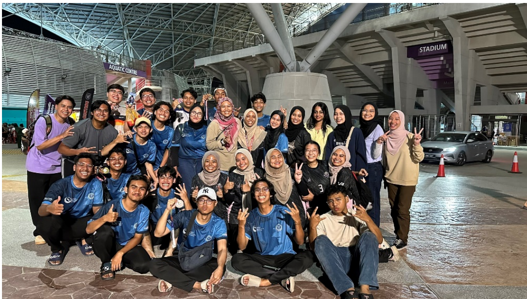
Team from Faculty of Medicine