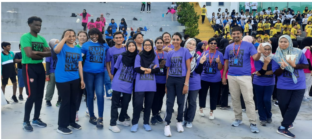
Purple power in action! FOM staff and students lighting up the Color Run with energy and smiles

Saturday began with a burst of energy as students and staff gathered for the MAHSA Color Run, which took place at The Quake. FOM participants, proudly donning their purple shirts, created a vibrant sea of colors and smiles as everyone embraced the spirit of unity and health.