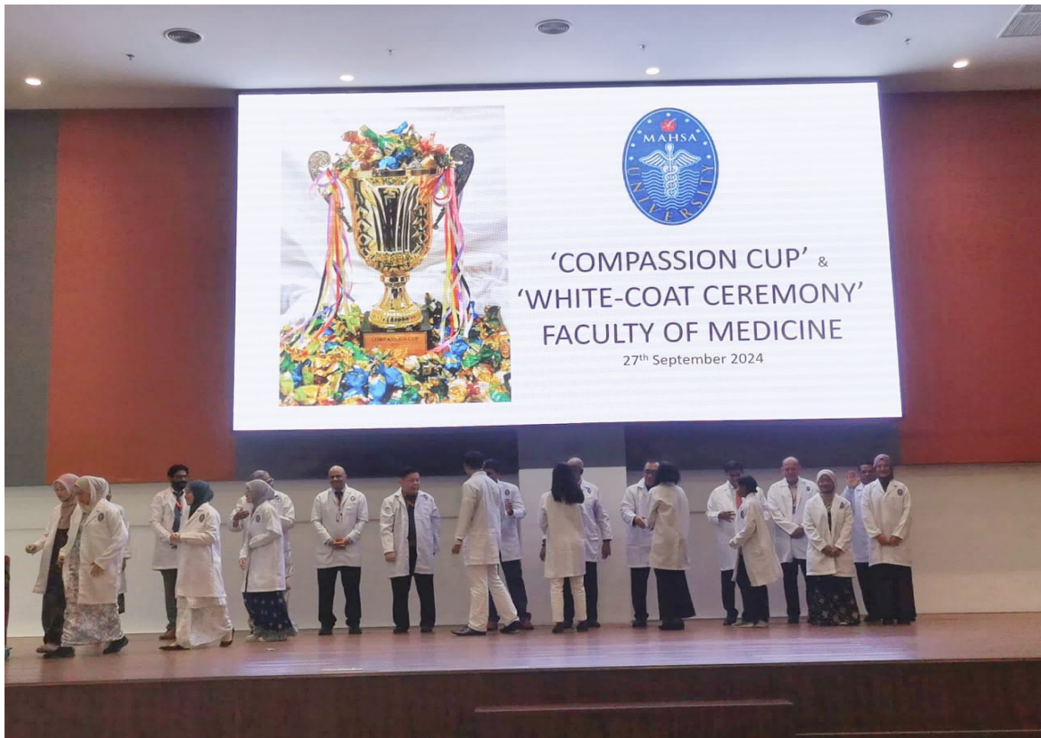
Students were proudly donned with their white coats, symbolizing their official entry into the medical field