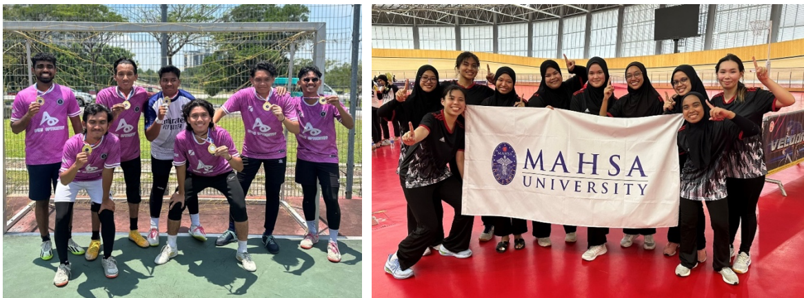
Futsal (on the right) and netball (on the left) teams after their winning

Bronze 1: Table Tennis (Male) participate by student from FOHSNE